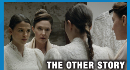
THE OTHER STORY